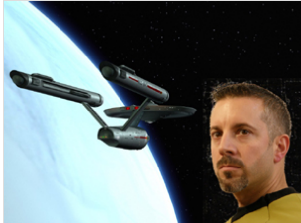
Warp Speed Ahead

Using that good premise, I then started to formulate how we could do a time travel story with George Washington. I wanted it to be an original one that did not have too many of the "time travel clichés" – time travel stories always pertain to either history being changed and then fixed without altering the timeline or a paradox where it was "meant to be" for outside involvement destined to take place.