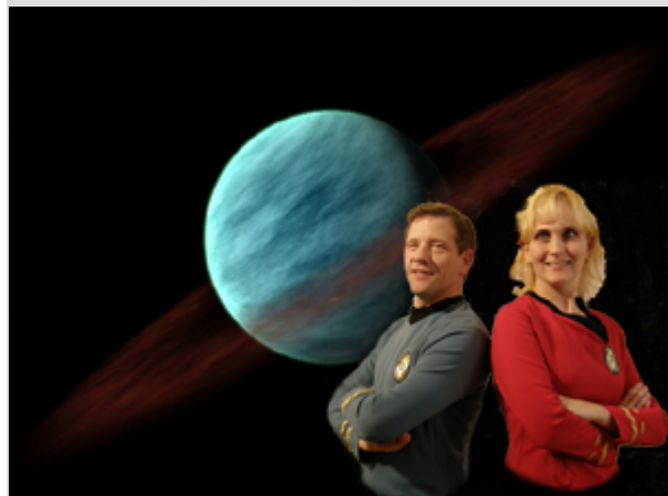
On screen and off, its easy working together.